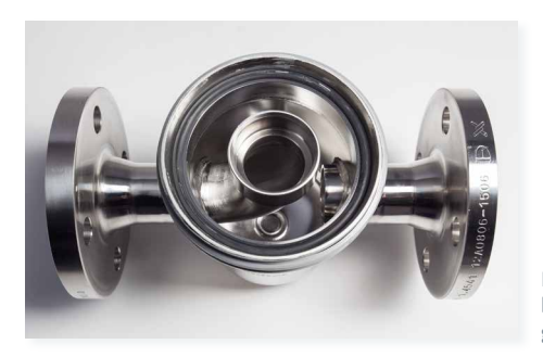
Even lower pressure loss by utilising optimal flow guidance