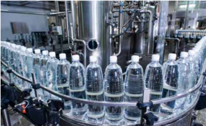
Manufacturing PET bottles