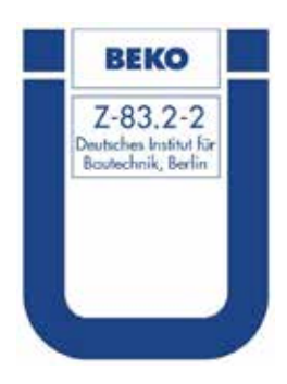
BEKOSPLIT<sup>®</sup> is type-approved in Germany

By law, condensate must be disposed of safely. The BEKOSPLIT<sup>®</sup> emulsion splitting plants combine economy and ecology, as they enable you to process condensate at the point at which it occurs in a safe and cost-effective manner.