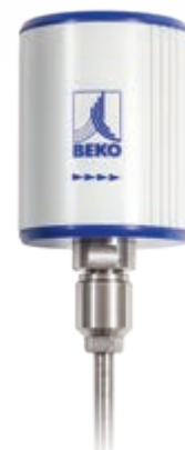
Volume flow meter