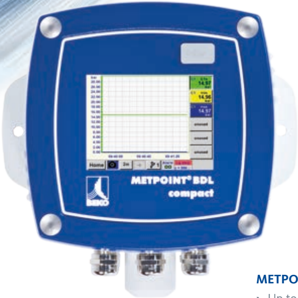
METPOINT® BDL compact