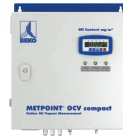
Oil vapour measuring device