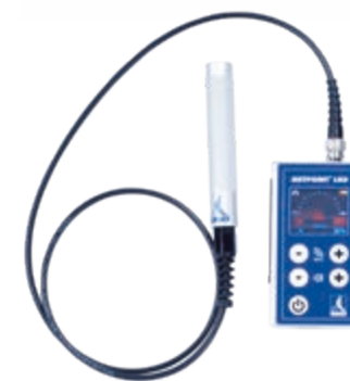
Leak measuring device