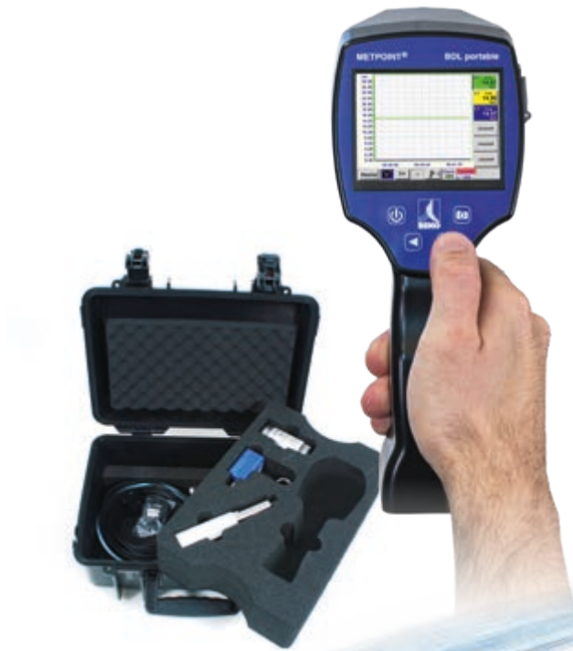
METPOINT® BDL portable