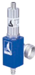
Pressure dew point sensor