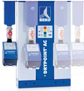
Can be installed on the side and front