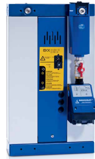
Installation at the back